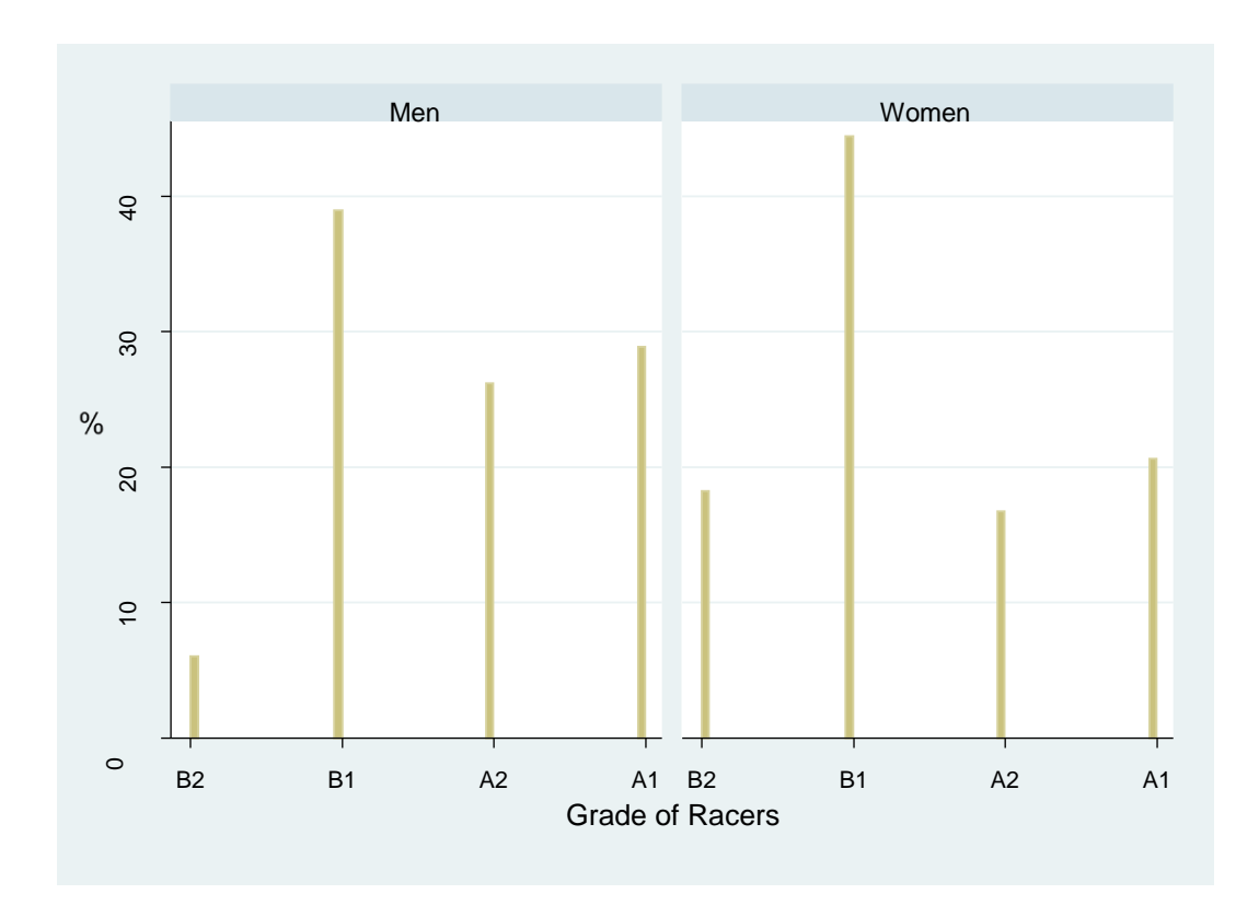
Figure 2. Distribution of racers' grades A1 (top grade), A2, B1, and B2 (bottom grade).